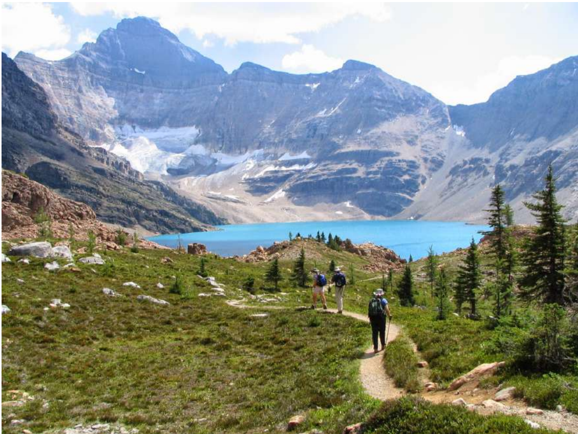
High-Level Circuit Trail Arriving at Lake McArthur

The High-Level Circuit Trail to Lake McArthur traverses a short grassy slope before climbing along a ledge and leveling off in the small meadow at the top. Beyond the meadow, a short uphill climb brings you to a knoll that offers stunning views of Mt. Biddle and Lake McArthur. Continue down to the lake and return the way you came, or complete the circuit by joining up with the Low-Level Circuit Trail.